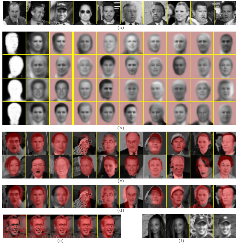
Fig. 2. (a) Examples of the training data. (b): Samples from the learned model. For the first three columns the format is similar to Fig. 1b, they demonstrate how shape ( \mathbf{m} , left) and appearance ( \mathbf{v}^F , middle) combine to the joint sample (right). The remaining columns show further samples from the model. For the joint samples the red area is not part of the object. (c): Inferred masks \mathbf{m} (foreground-background segmentations) for a subset of the test images. Masks are superimposed on the test images in red. In most cases the model has largely correctly identified the pixels belonging to the face. Test images for which the model tends to make mistakes typically show the head in extreme poses. Labeling of the neck and the shoulders is somewhat inconsistent, which is expected given that there is considerable variability in the training images and that the model has not been trained to either include or exclude such areas. The same applies if parts of a face are occluded, e.g. by a hat. (d) Test images with random masks superimposed. If masks are randomly assigned to test images the alignment of mask and image is considerably worse. Additional training images and segmentation results and a comparison with results for a conventional conditional random field can be found in the supplemental material [13]. (e): Convergence of the segmentation during learning (inferred mask \mathbf{m} superimposed on training image before joint training (left most) and after 10, 20, 100 and 1000 epochs of joint training). At the beginning the segmentation is driven primarily by the background model and thus very noisy. (f) Two examples of the pairs of images used for the recognition task.